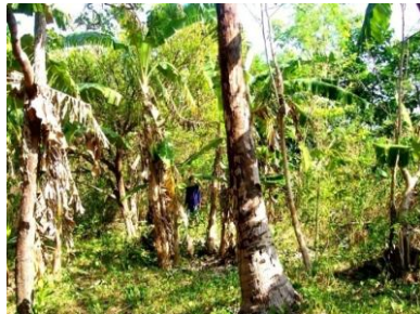
View of property surroundings