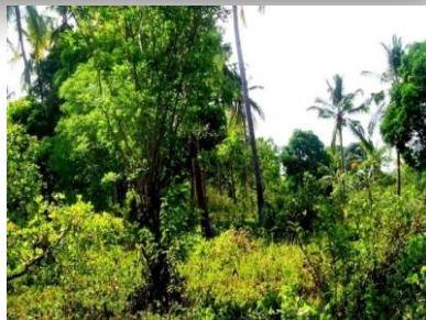
View of tropical plants