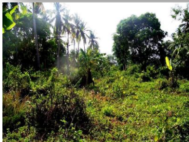
View of productive farm