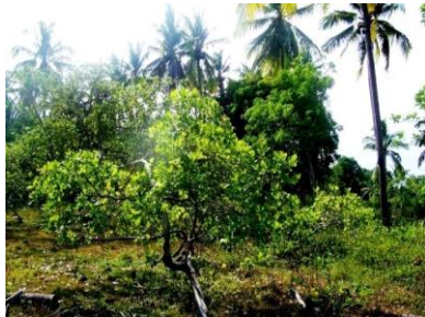
View of property surroundings