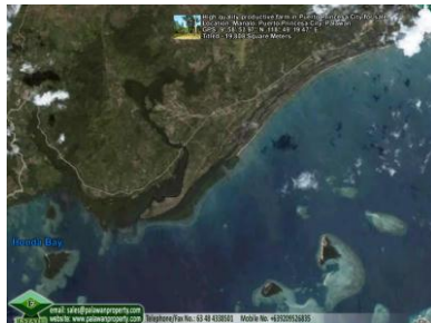
View of satellite area map