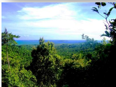
View of Honda Bay on Property