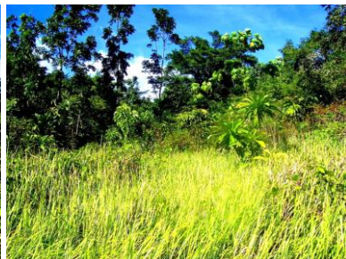
View of property interior