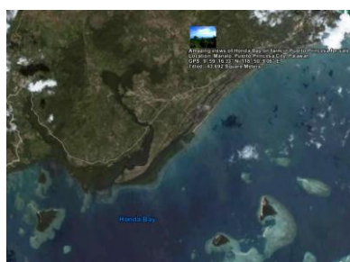
View of satellite area map