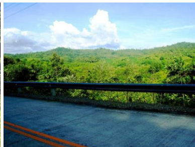
View of National Highway