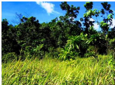
View of property interior