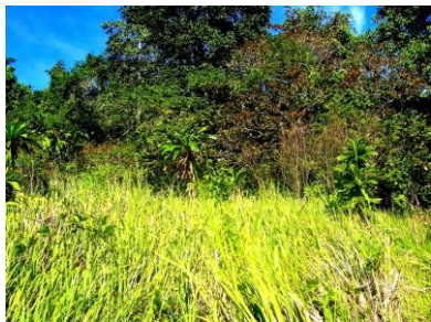
View of property interior